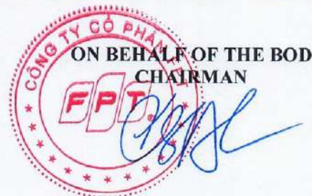
Truong Gia Binh

Note: All expenses related to the attendance at FPT's AGM, which include accommodation, traveling and other personal expenses will be borne by shareholders.