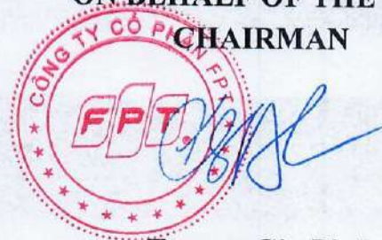
Truong Gia Binh